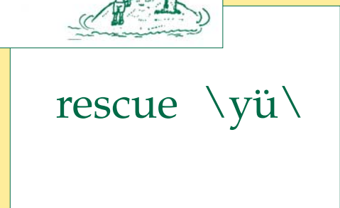
Phonics Drill Cards (with pictures) : actual size is 3 x 5 inches