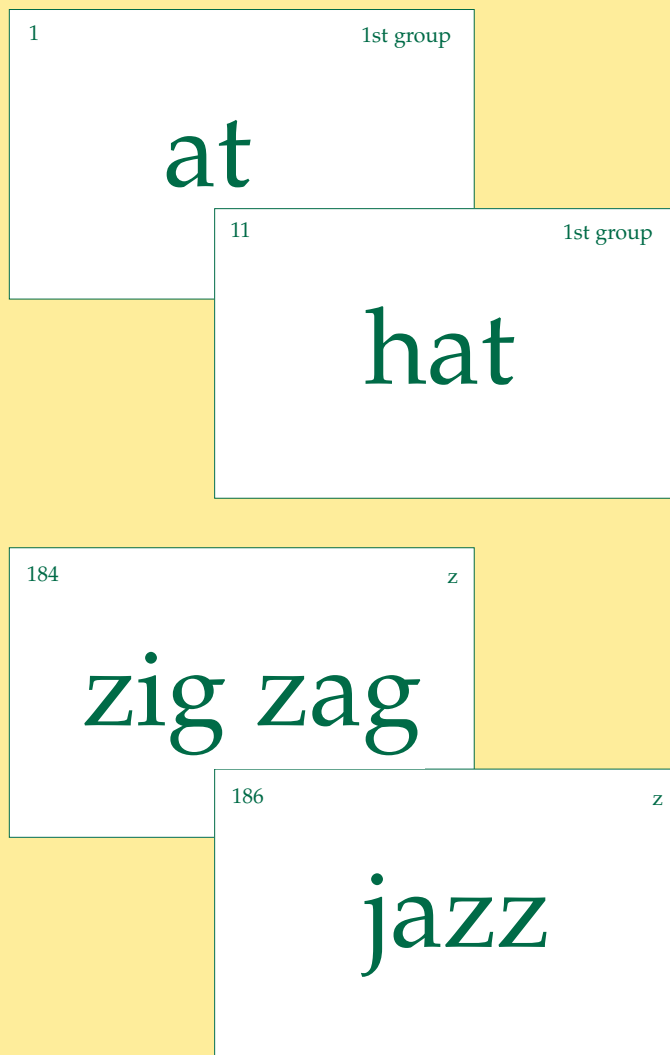
Phonetic Word Cards: actual size is 2 3/4 x 4 inches

Group IV: Hard and soft C and G and diphthongs added.